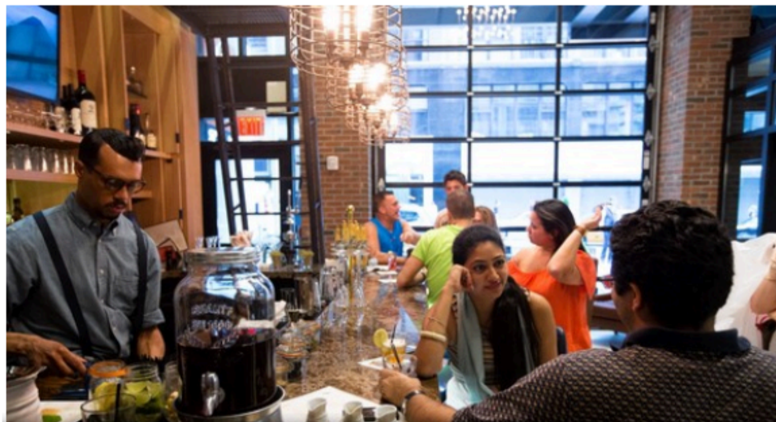
fabrick

David Burke fabrick, 47 W. 38th St. between Fifth and Sixth avenues; open for lunch Monday through Friday from 11 a.m. to 5 p.m. and Saturday and Sunday from 10:30 a.m. to 3:30 p.m.; 212-302-3838.