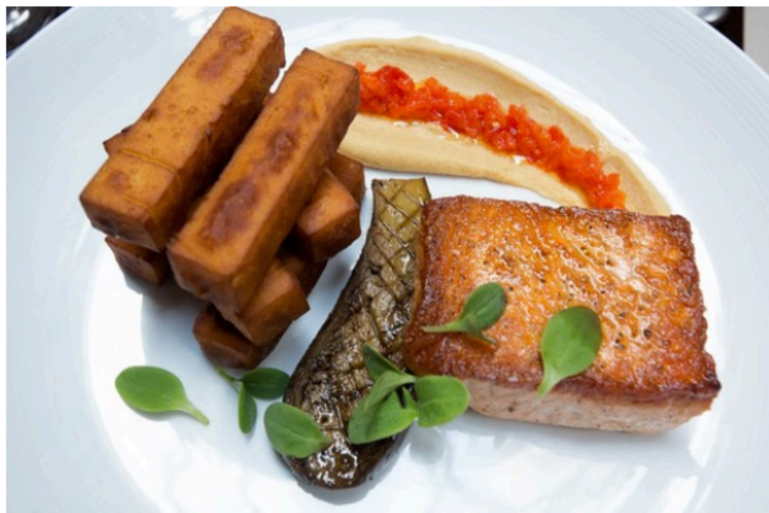
The seared salmon.

By NATALIE OSTERLING Updated June 30, 2014 1:59 p.m. ET